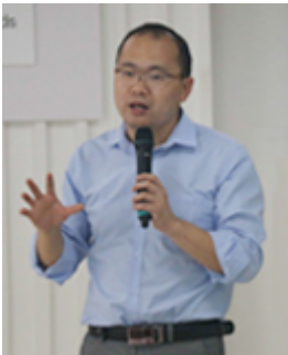
蔡雁岭教授，郑州大学